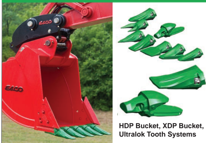
HDP Bucket, XDP Bucket, Ultralok Tooth Systems