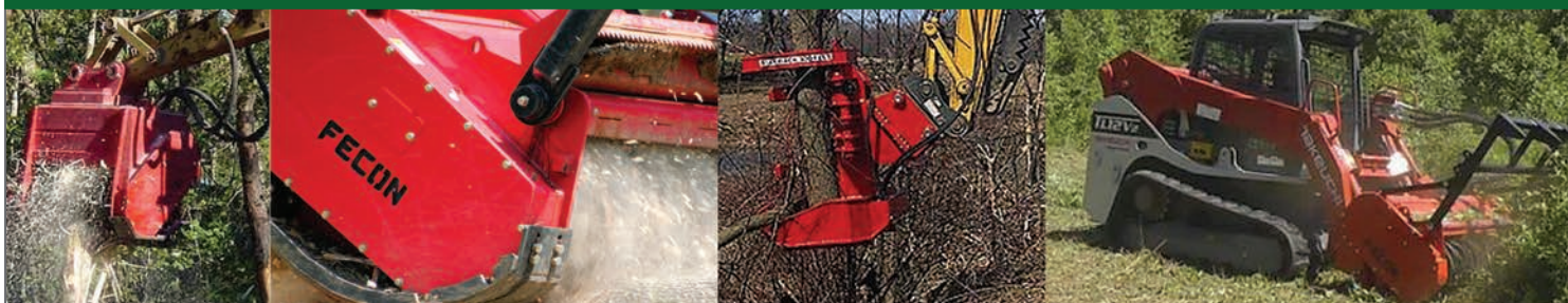
Bull Hog-Excavator, Hydraulic & Skid Steers, Grapple, Tree Shears