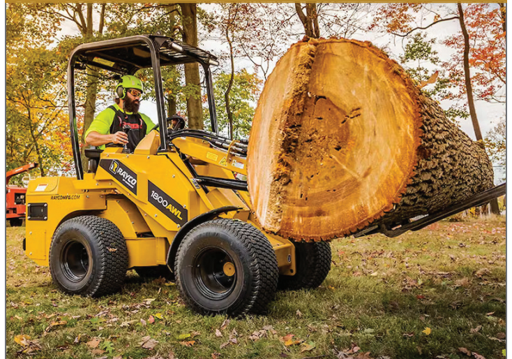
Articulated Wheel Loaders