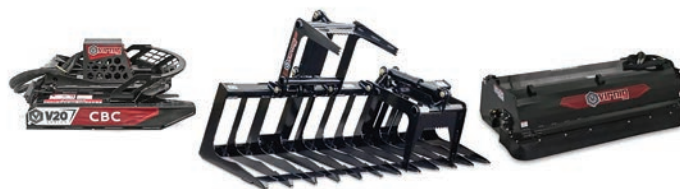
Rotary Brusher Cutters, Grapples, Pick-up Brooms, Auger Drives, Auger Bits, Tree Disc Mulchers