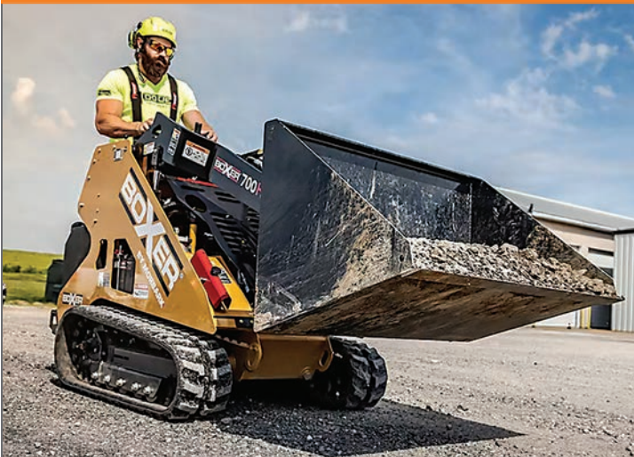
Mini Skid Steers