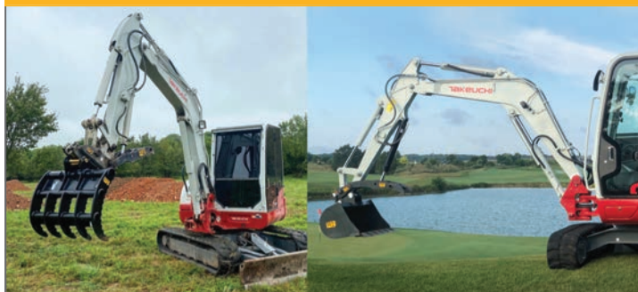
Manual Couplers, Hydraulic Couplers, Thumbs, Smooth / Tooth Buckets