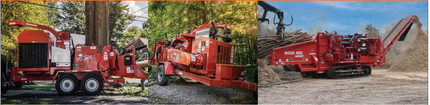
Brush Chippers, Horizontal Grinders, Tub Grinders