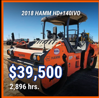
HA18048 LUBBOCK, TX 84" TANDEM ROLLER WITH VIBRATION AND OSCILLATION DRUM