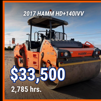
HA17047 LUBBOCK, TX OROPS, 84" DOUBLE DRUM ROLLER