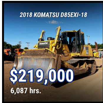
KM18420 AMARILLO, TX CAB, A/C, INTEGRATED INTELLIGENT GPS, SIGMA SU BLADE, RIPPER,

Every qualifying Komatsu unit includes a 5-Year / 2,000-Hour Komatsu Care Agreement* + 3.99% financing for 48 months!