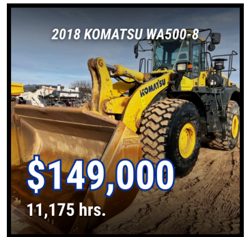
KM18291M AMARILLO, TX CAB, A/C, HEAT, JOYSTICK STEER, 2 SPOOL, 7.6 CU YD GP BUCKET WITH BOCE, 29.5 R25 TIRES