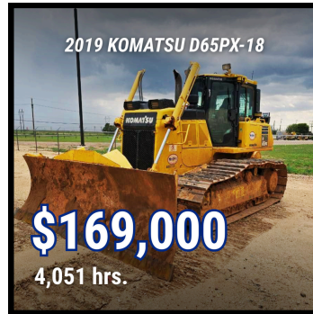
K19270P LUBBOCK, TX CAB, A/C, WINCH, LGP, PAT BLADE,