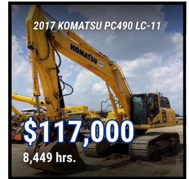
KM17689 AMARILLO, TX A/C, AUX HYDRAULICS, 11'11" STICK, 35.5" PADS, CAMERA, NEW UNDERCARRIAGE