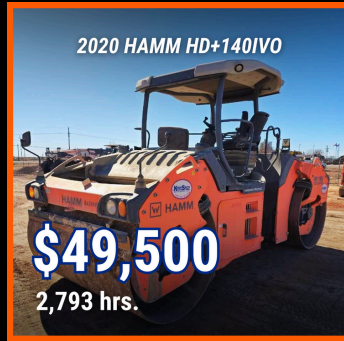
HA20015 LUBBOCK, TX 84" DOUBLE DRUM SMOOTH VIBRATORY ROLLER