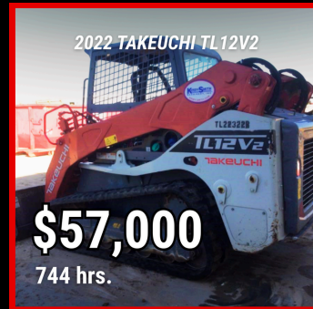
TL22322R AMARILLO, TX orops, rubber track, aux hyd