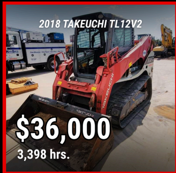
TL18148 AMARILLO, TX CAB, RUBBER TRACKS