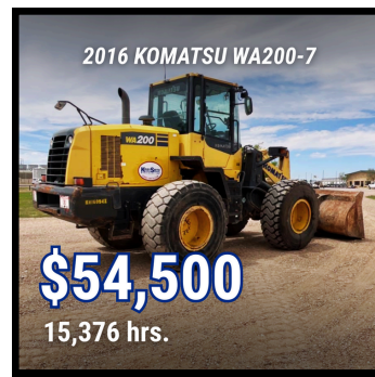
KM16094X LUBBOCK, TX CAB, A/C, COUPLER, BUCKET