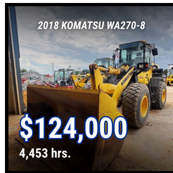
K181284M AMARILLO, TX CAB, A/C, 3 SPOOL, PIN ON 4 YD BUCKET, AUTOLUBE, 20.5 TIRES,