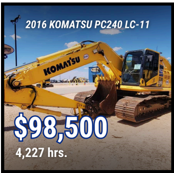
KM16925X LUBBOCK, TX A/C, HYDRAULIC COUPLER, 31.5" SHOES, CAMERA