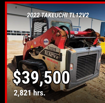
TL22321R LUBBOCK, TX CANOPY, RUBBER TRACKS

*QUALIFIES FOR A $2500 PARTS CREDIT WITH PURCHASE