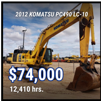
KM12258X LUBBOCK, TX A/C, AUX TO END OF BOOM, NO LINES ON STICK