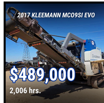
KL19018 AMARILLO, TX KLEEMANN MCO 9SI MOBICONE, LOW HOURS