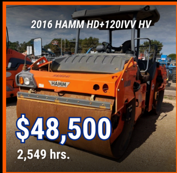
HA16041X AMARILLO, TX 78" DOUBLE SMOOTH DRUM

*QUALIFIES FOR A $5000 PARTS CREDIT WITH PURCHASE