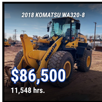
KM18390X AMARILLO, TX CAB, A/C, QUICK COUPLER, 3 SPOOL, BUCKET