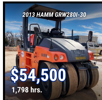
HA13046U LUBBOCK, TX OROPS, WATER SPRAY SYSTEM.