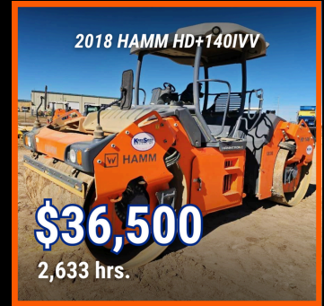
HA18049 LUBBOCK, TX 84" DOUBLE DRUM SMOOTH VIBRATORY ROLLER

*QUALIFIES FOR A $5000 PARTS CREDIT WITH PURCHASE