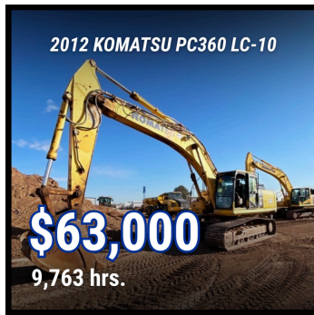
KM12250X AMARILLO, TX A/C, AUX HYDRAULICS, 10'6" STICK, 33" SHOES, BKT