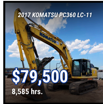
KM17617 AMARILLO, TX A/C, HYDRAULIC THUMB, CAMERA