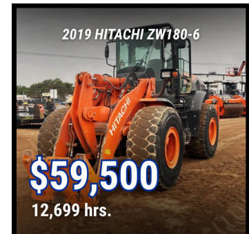
HI19000X AMARILLO, TX HITACHI ZW180-6 LOADER